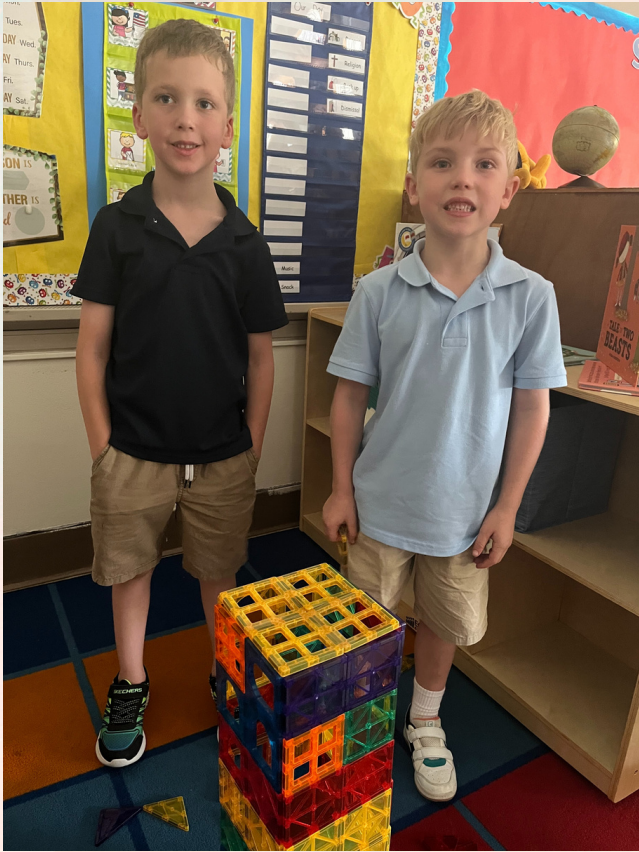
Our students are loving the Magna-Tiles that were donated!