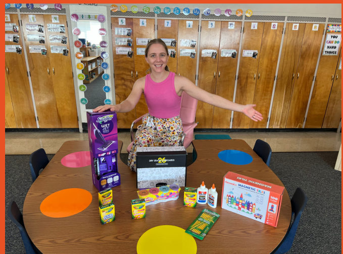
Some of the items that were donated to our teachers.