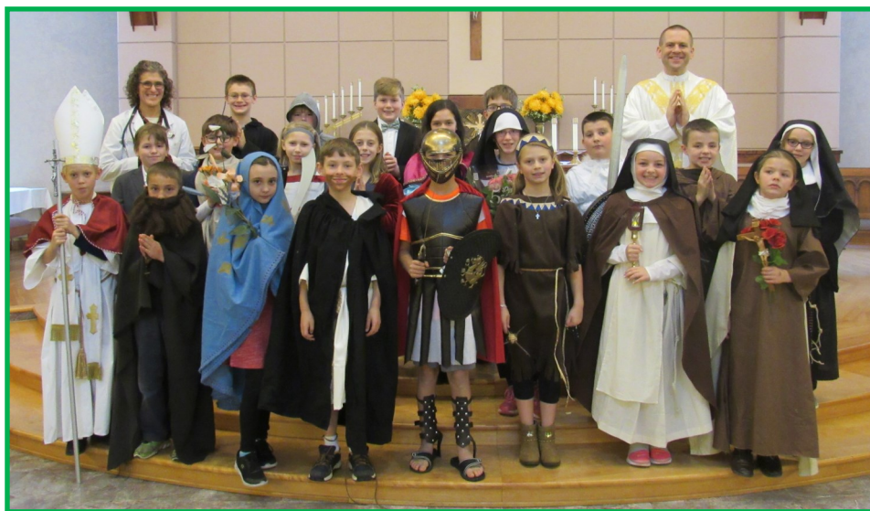
On All Saints' Day the 4th graders presented reports on a chosen saint.

Fifth Grade - Google Sheets assignment about the explorers. Graphs and charts with research about each.