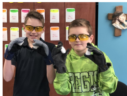
Fifth Grade Science Experiments